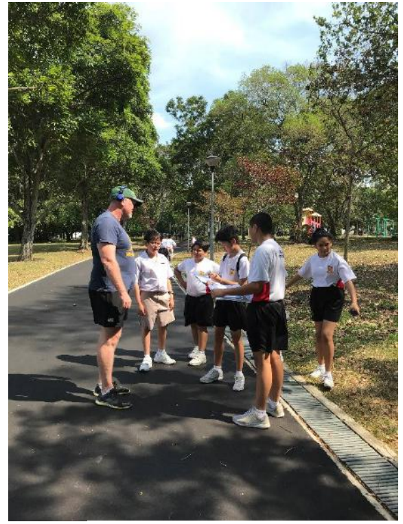
Interviewing a park user

Secondary 1 students visited the Bedok Reservoir Park to investigate how clean the water in Singapore is.