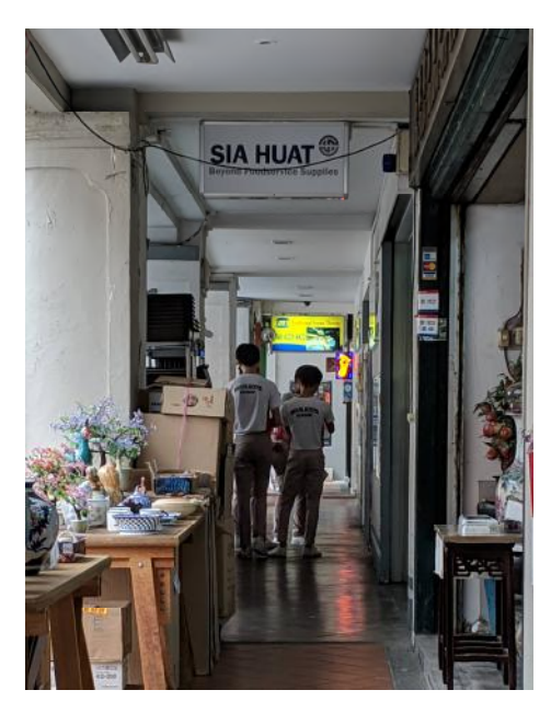
Conducting land use survey along the streets of Chinatown