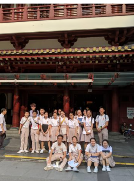
Taking a shot together at the end of the GI