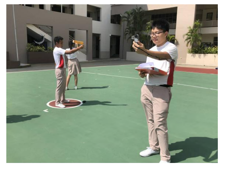
Measuring wind speed using a weather tracker