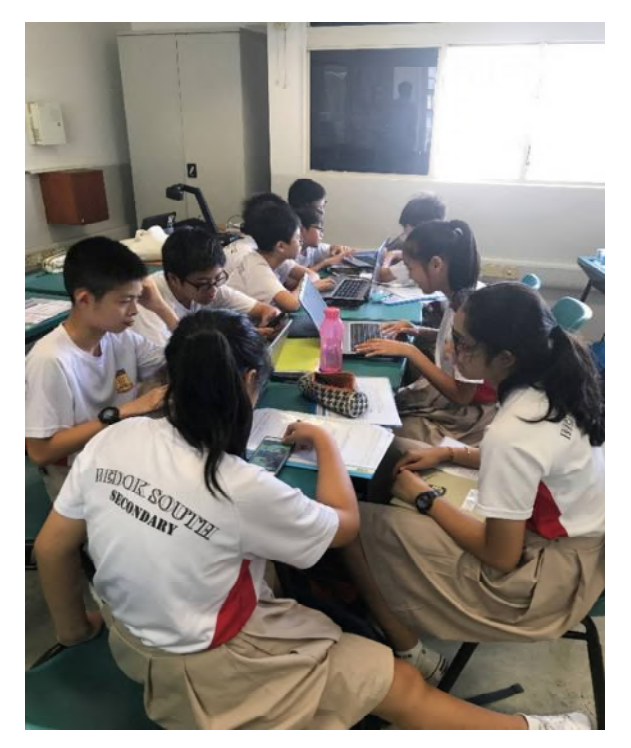
Group discussions using laptops in class

Secondary 2 students investigated if their housing estate is an inclusive neighbourhood.