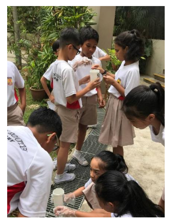
Dividing the water samples for further testing