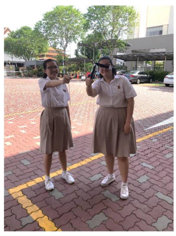
Using a sling psychrometer and thermometer