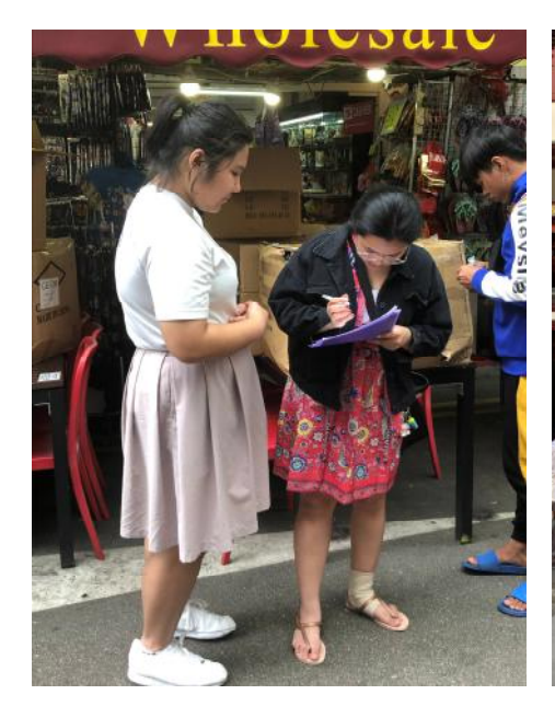
Interviewing tourists in Chinatown

Secondary 4 Geography students visited Chinatown to find out what makes it a tourist destination.