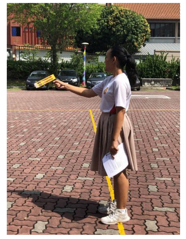
Collecting relative humidity data at the school carpark