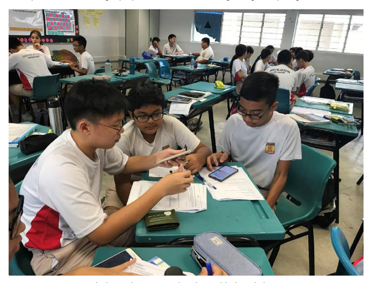
Independent research using guided worksheets